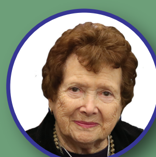
Crystal Hawk Toronto, Canada

Plan now to join Therapeutic Touch International Association and Therapeutic Touch Network Ontario in Toronto at The Kingbridge Centre.